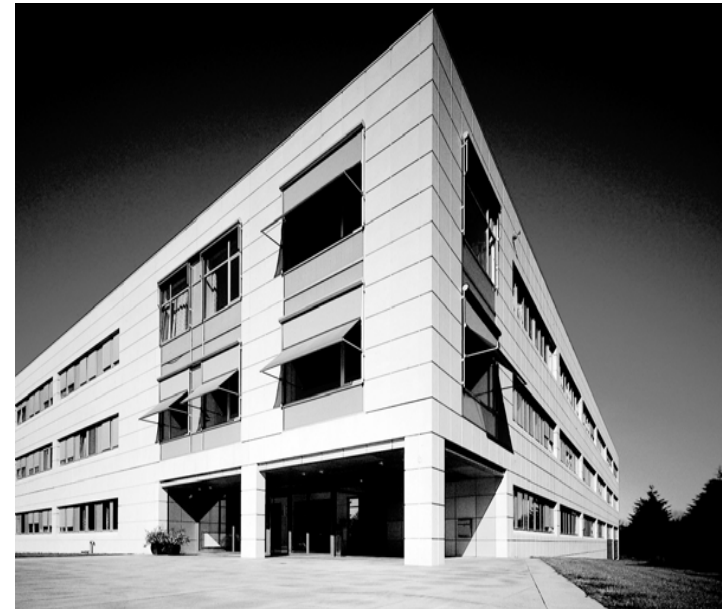
Headquarters in Hørsholm, Denmark